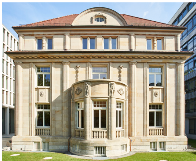
In the “Villa 102” in Frankfurt, KfW Stiftung presents projects in its main areas of focus.

In this context, responsible entrepreneurship, social commitment, environmental protection and climate action, as well as arts and culture are in the focus of its activities.