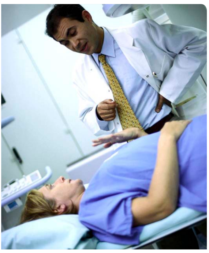
After your angiogram, your doctor will discuss the results with you.