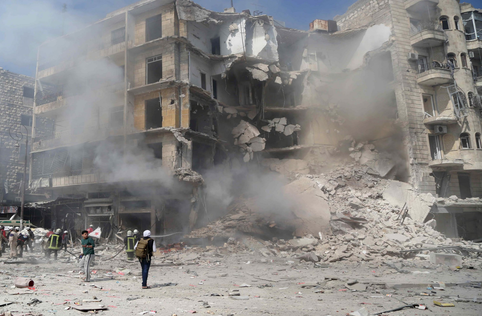
Residents inspect damage in a site hit by what activists said was a barrel bomb dropped by regime-controlled aircraft in Aleppo, April 18, 2015.

The principle of “do no harm” argues against funding or otherwise supporting a model of state-centric, centrally-driven development in the absence of a legitimate, stable central government in Damascus. Although state-centric development is the model to which states and international organizations are accustomed, in the case of Syria it may well generate recurrent cycles of political unrest and violence by reinforcing the Syrian regime’s corrupt, ineffective, and exploitative political economy. In any event, this path would not generate meaningful rebuilding results. It would also present the obvious political and legal hurdles of helping a government with a well-documented record of atrocities rebuild a country it had a hand in destroying.