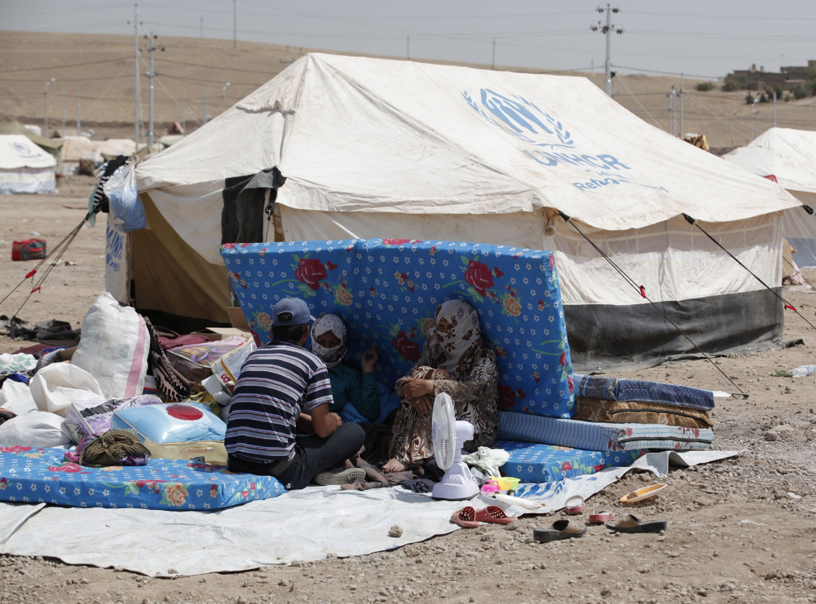
Syrian refugees in Kawrgosk refugee camp, Erbil, Northern Iraq in 2013.

substantial in regime-controlled Syria outside the regime's purview and without rewarding Assad and his clients, necessarily directs international efforts away from government territory. The remaining choices are to do nothing, or to rebuild in non-regime areas.