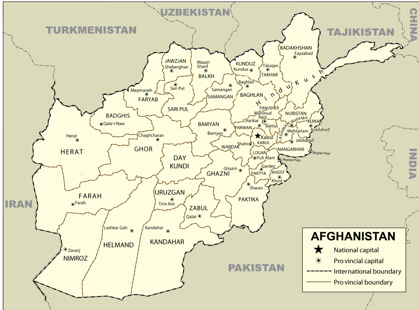
Figure I. Map of Afghanistan