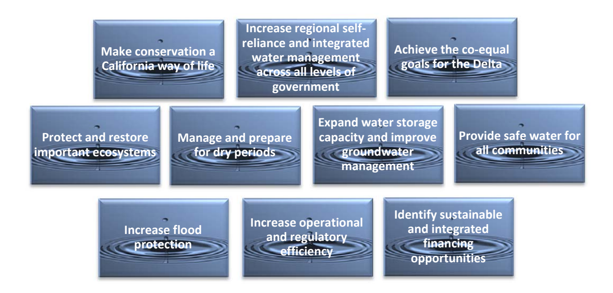
Figure 2. California Water Plan Action Items

This Storm Water Strategy further emphasizes and supports the following actions identified in the California Water Action Plan: