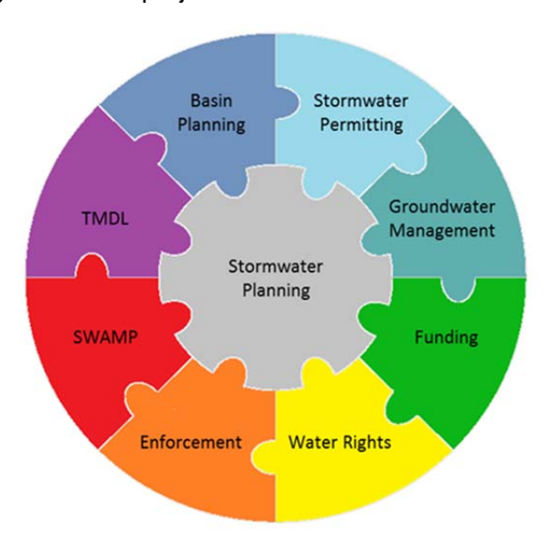
Figure 3. Storm Water Planning Interconnectivity with Water Board Programs

The Storm Water Planning Unit will collaborate with other related Water Board programs including but not limited to, storm water permitting, basin planning, TMDLs, Surface Water Ambient Monitoring Program (SWAMP), enforcement, water rights, funding, and groundwater management, to ensure that input, updates, and assistance are provided holistically from a Water Boards perspective (Figure 3). In addition, the Water Boards have assigned four Executive Sponsors, along with committed participation from staff in four Regional Water Boards (San Diego, Los Angeles, Central Coast, and North Coast) to assist and provide regional expertise and guidance for project outcomes.