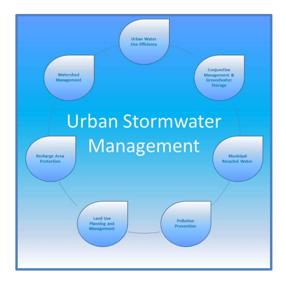
Figure 1. Urban Stormwater Runoff Management